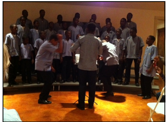
During the Performance