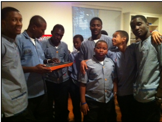
During the Warm-up