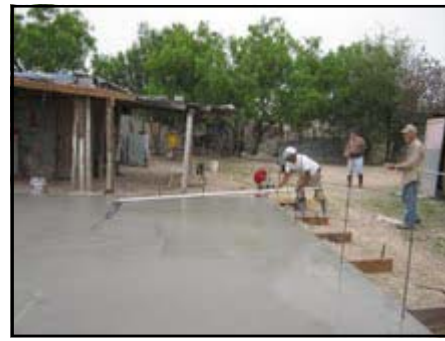
Above: The concrete arrives for the foundation and the workers smooth the floor.

The sewing ministry continues to make beautiful bags and aprons that the mission team is selling for them. The women continue to improve in their sewing projects. The sale of these items go into the sewing account at El Buen Pastor which pays each of the women, gives some to the church, and keeps the remainder in the sewing account. The women are very motivated and proud of the work they have done. The sewing building is open and available to them for their own projects usually twice a week.