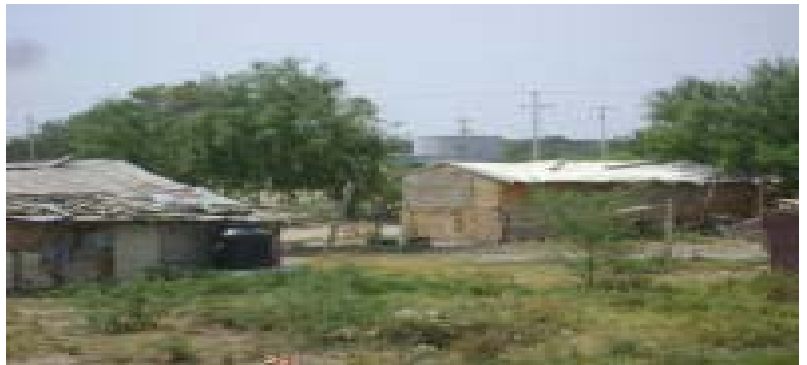
Below: Shelters in the Colonias

St. Luke's Episcopal Church 263 Spur 962 Cypress Mill, Texas 78663