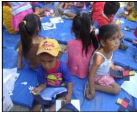
Above: Children attending Vacation Bible School in the Colonias of Piedras Negras, MX.