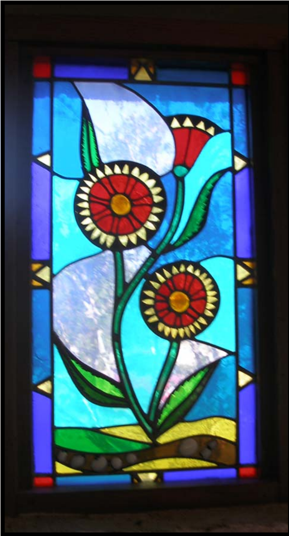
Photo: "Indian Blankets". Stained glass window, designed by Becky Crouch Patterson.

Located along the north wall of the Church. See related article.